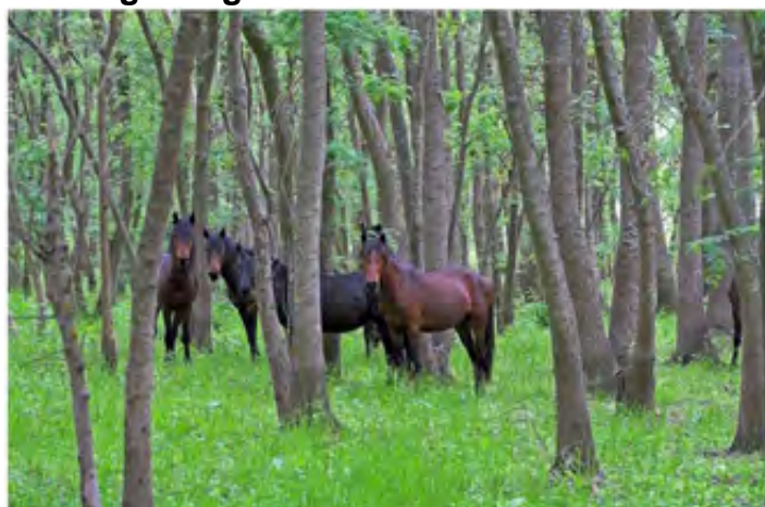
Letea Forest Horses, Romania

A further difficult subject is the theme of forest grazing. Within large protected areas there are often areas of forestry. These provide the animals with a natural protection for weather and insects. Alongside production of wood, grazing was a main use of forestry in the Middle Ages. With the advent of the forestry industry at 19 th Century, forest and meadow were separated. Thus, forest grazing became forbidden in many countries. Special regulations for forest grazing in protected areas are rare and need to be intensively and carefully ap-