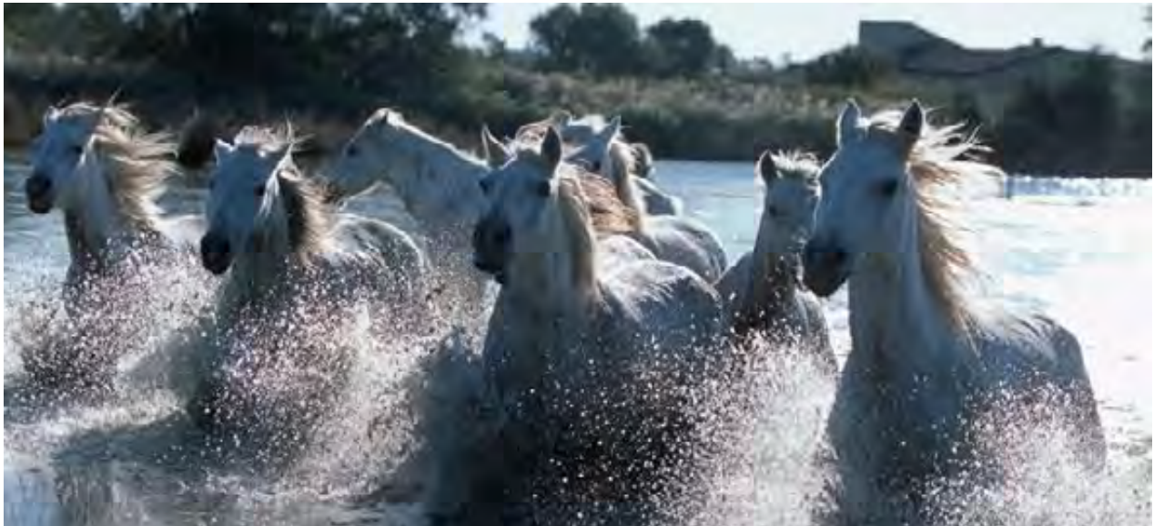
Camargue Horse

The feral, white Camargue horses are a well known breed from France. For visitors of the Camargue at the mouth of the Rhone river they are a symbol of freedom and adventure. Together with the Betizu cattle in the Pyrenees, the Chillingham cattle in England, the Sandsøya goats in Norway and many other breeds and varieties they were once farm animals and are now feral and exist mostly without the influence of humans – sometimes since many hundreds of years. In other parts of Europe, horses, cattle, goats and sheep